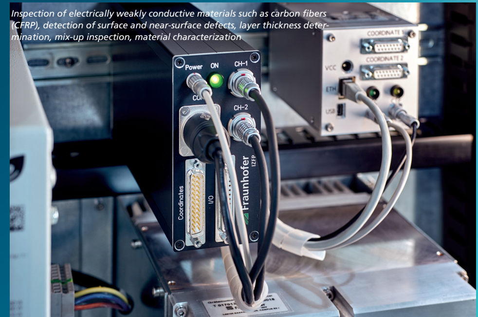
Inspection of electrically weakly conductive materials such as carbon fibers (CFRP), detection of surface and near-surface defects, layer thickness determination, mix-up inspection, material characterization

Sensor and Data Systems for Safety, Sustainability and Efficiency