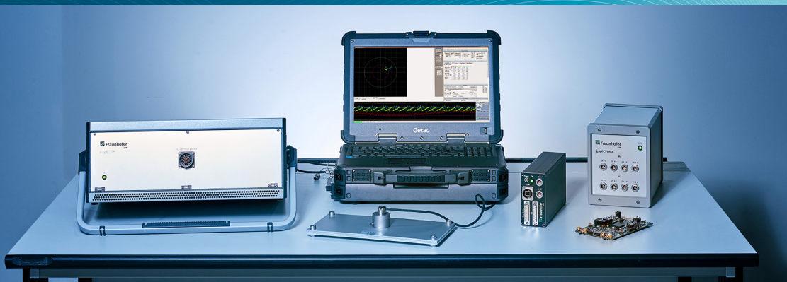
inspECT-PRO – product portfolio