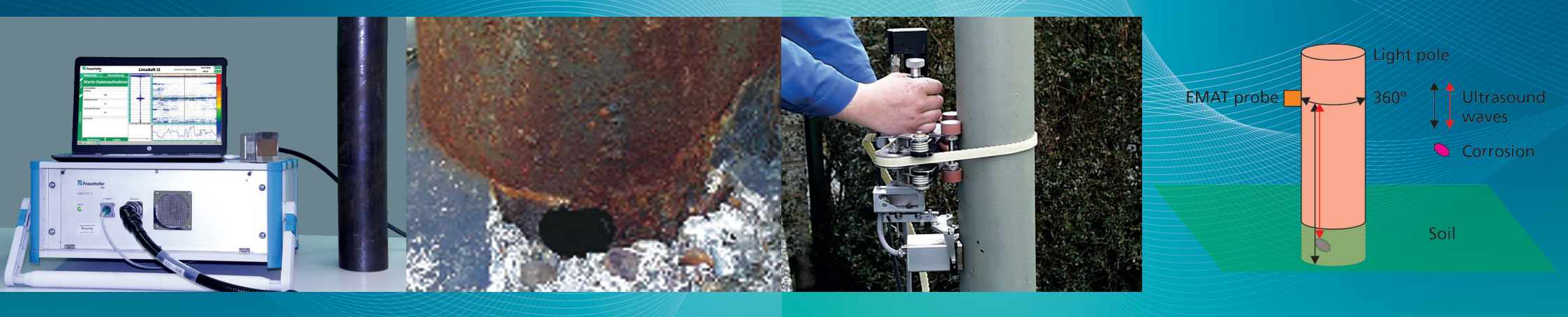
Left: LIMAtest® inspection system; right: Corrosion below soil level