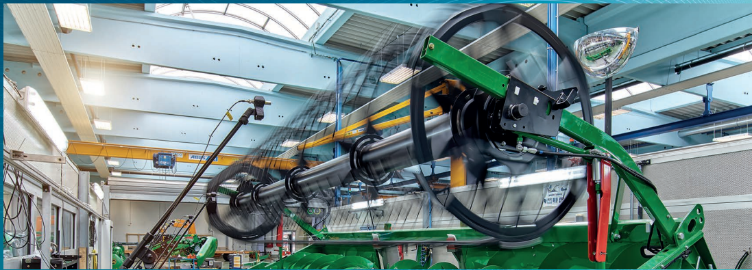
AcoustiX – acoustic sensor system, here on a combine harvester